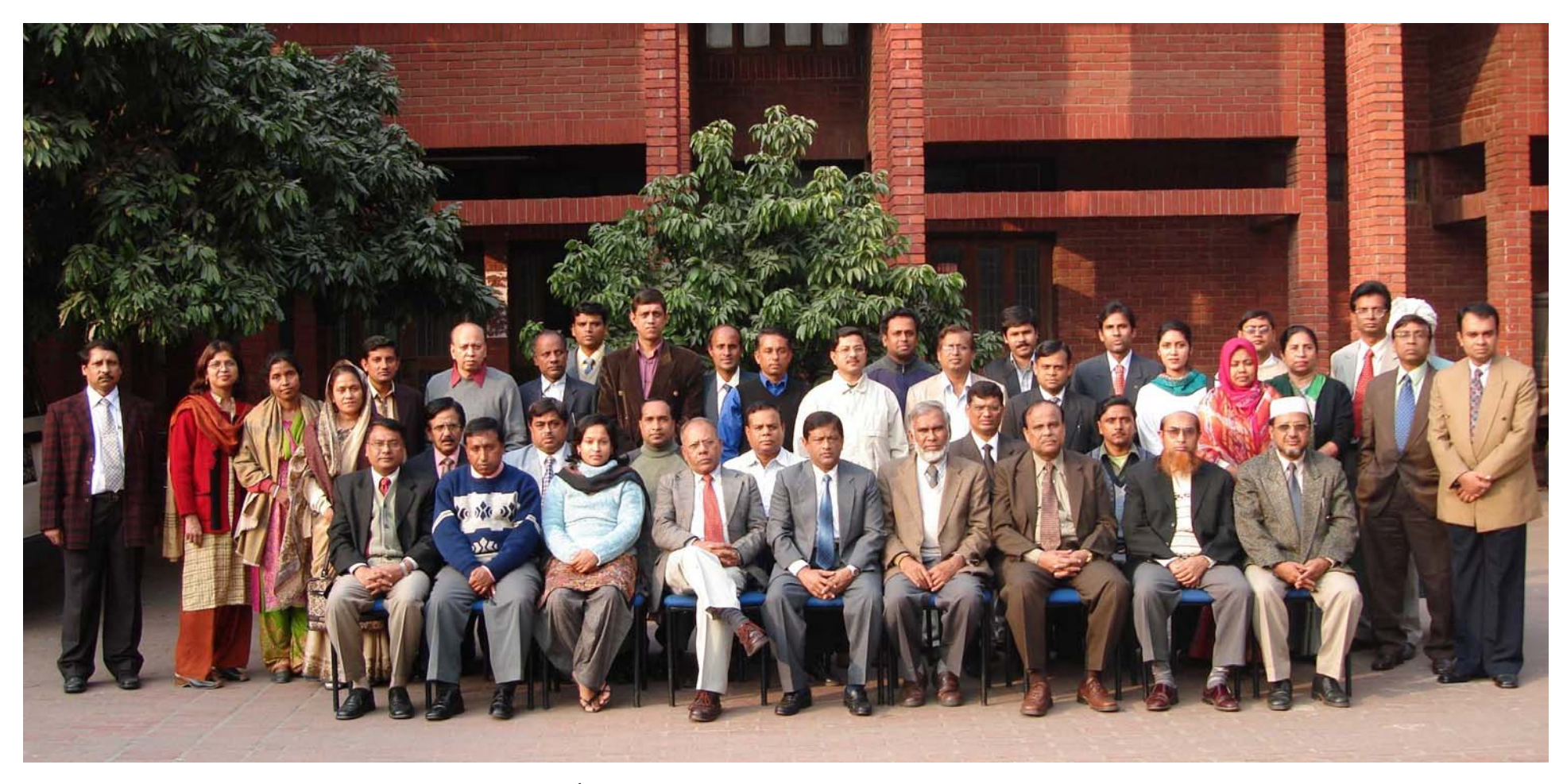
Participants from the stakeholder organizations at the 4<sup>th</sup> training-workshop on "The Implementation of the Global Plan of Action for the Conservation and Sustainable Utilization of Plant Genetic Resources for Food and Agriculture (GCP/RAS/186/ JPN)" held on 10-11 January 2007.